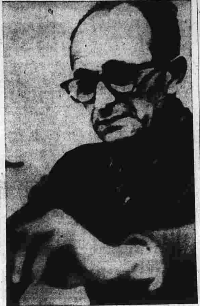
This Is Eichmann