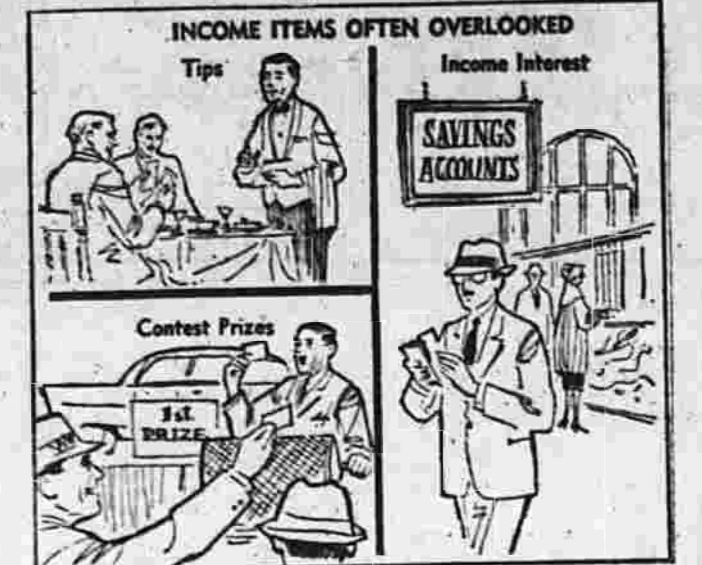
INCOME ITEMS OFTEN OVERLOOKED TIPS Income Interest SAVINGS ACCOUNTS Contest Prizes 1st Prize